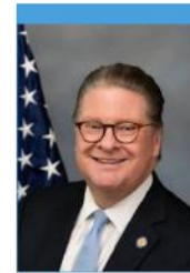
Senator Pete Harckham Senate District 40 in New York