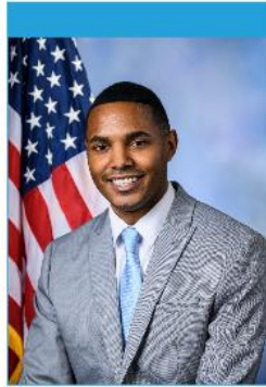
Rep. Ritchie Torres Congressman of New York's 15th District