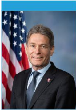
Rep. Tom Malinowski Congressman of New Jersey's 7th District